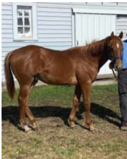
SWEET MITCHAROO 2023 SORREL GELDING AQHA #6306802